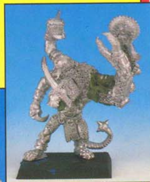
Above: And this is my humble creation, bedecked with pieces from every corner of the Citadel range.

due to lack of energy or obstructing models, the Rat Golem moves as far as possible, then stops and does nothing.