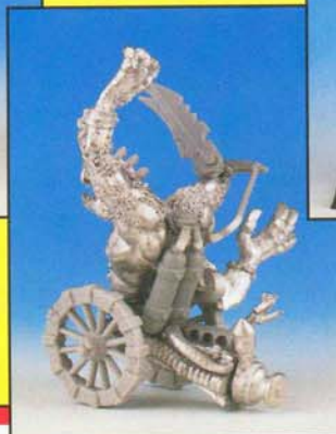
Right: The view the Warriors want to see of Andy's bizarre looking Rat Golem...